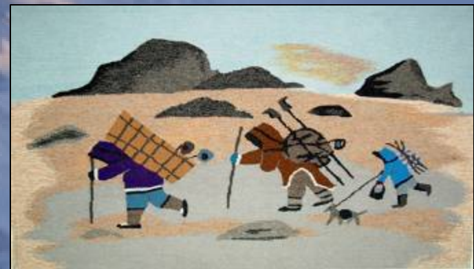
Elisapee Ishulutaq / Geela Keenainak