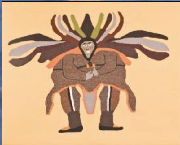
Ekidluak Komoartuk / Kawtysie Kakee